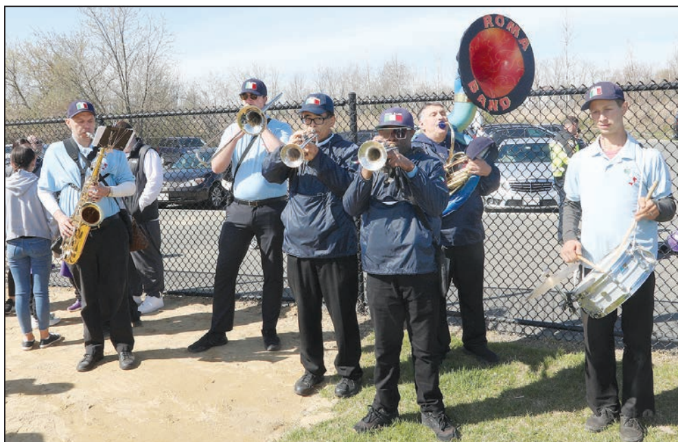
The famous Roma Band of Boston playing the National Anthem.