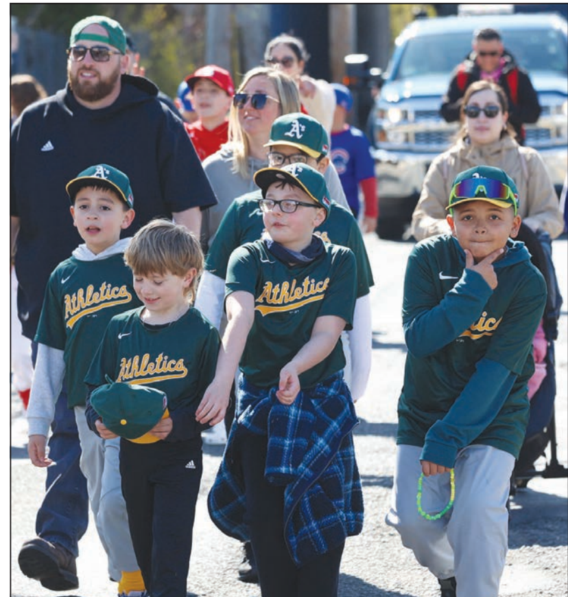
The Athletics along the parade route during the season-opening parade held on Saturday. See more photos on Pages 14 and 15.