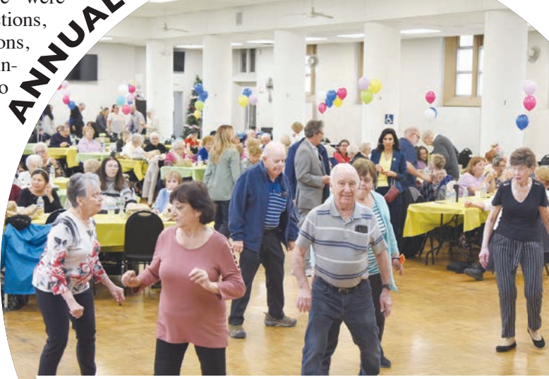
Revere seniors dancing to "Memories" during the Spring Fling at Saint Anthony of Padua Parish on April 24. See more photos on Page 4.

SEE PAGE 16 FOR A STROLL THROUGH TIME 2004 EDITION