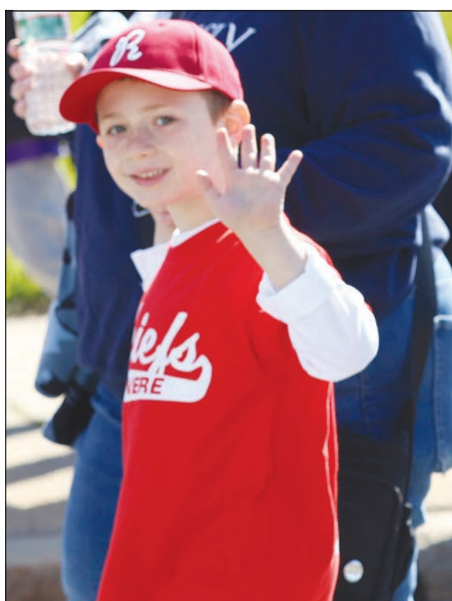
A Royals team member waves to the camera.