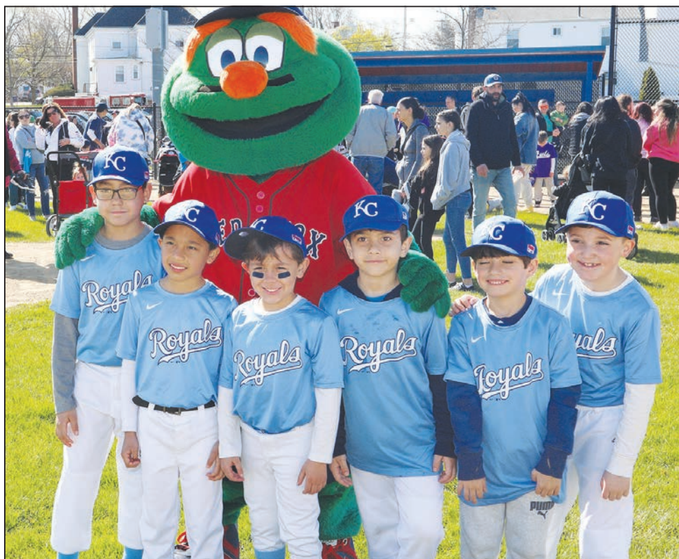
Wally with the Royals.

After the brief but emotional ceremony, all players were treated to free hot dogs from the newly organized concession stand. Look for many more treats and a wide selection in the upcoming season from the refreshment stand. If the season goes the way the parade went, it will be a great season for everyone.