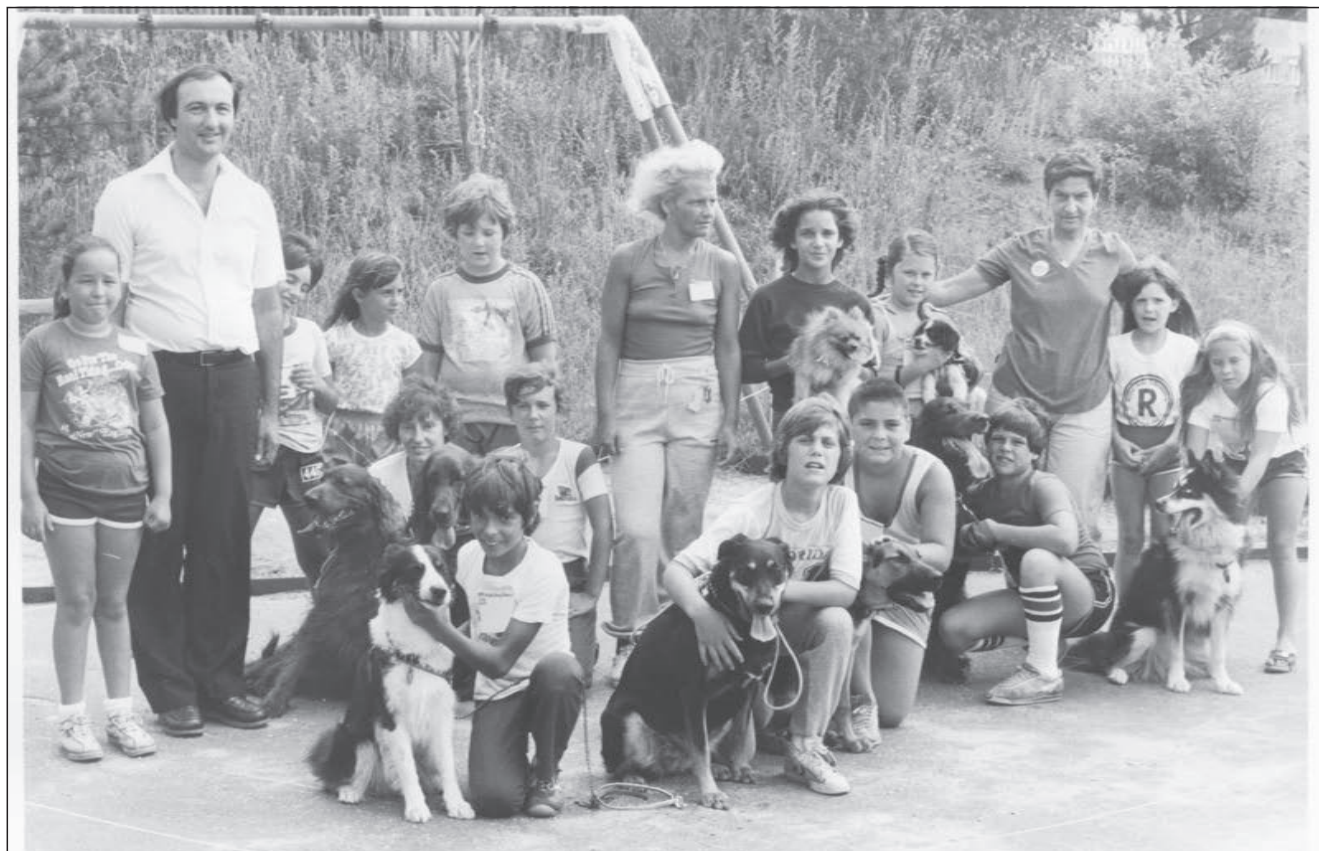
Shown above residents with their dogs during Dog Day in 1981.

Mayor George V. Colella submitted a budget of $33,992,045 this week, stating that the city finally has weathered the storm of Prop. 2 and 1/2, which