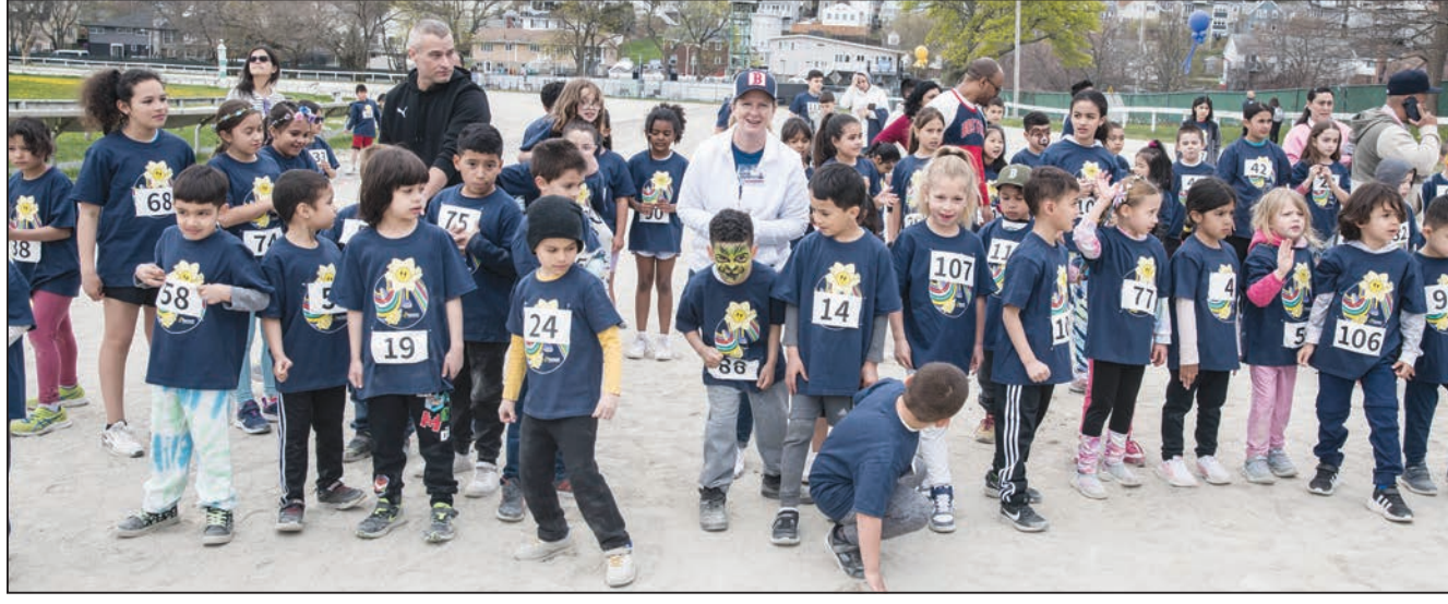
The 5 and 6 year olds prepare themselves for take off.