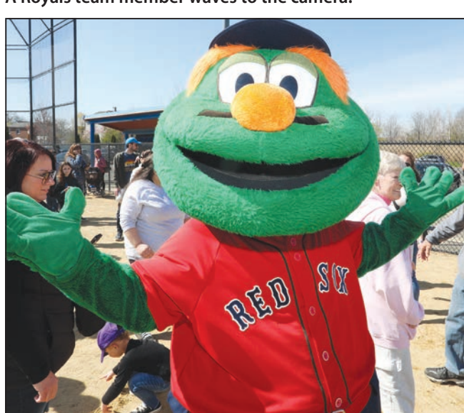
Wally of the Boston Red Sox was the most popular guy on the field.