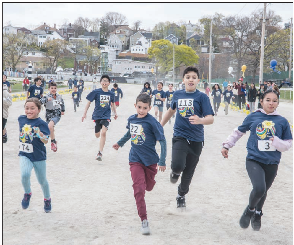
The 11-and 12-year-olds make their way down the track.

We are changing our name. Our commitment to community-based care is the same. Learn more at ebnhc.org