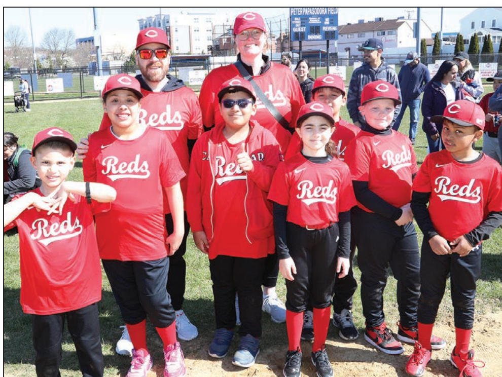
The Major League Reds are happy to start the season.