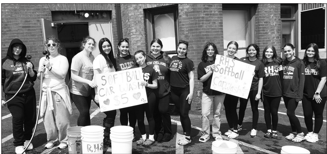
The RHS Lady Patriot Softball Team wishes to thank all that came to support their efforts last Saturday morning.

The team, who is vying for its first tournament berth since 2020, were busy from start to finish thanks to the generosity of so many who stopped by or made donations. The