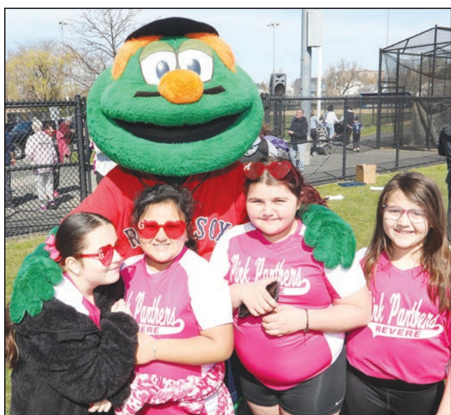
The Pink Panthers softball team members take a photo with Wally.