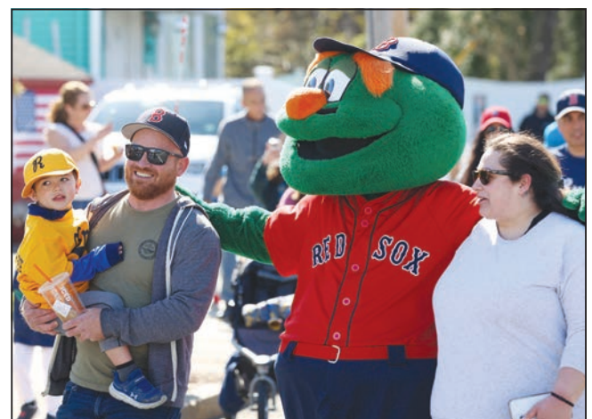
Wally was a big part of the opening ceremonies.