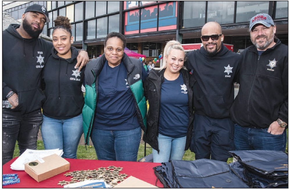
Members of the Suffolk County Sheriff staff were on hand to lend their support for the 5K.