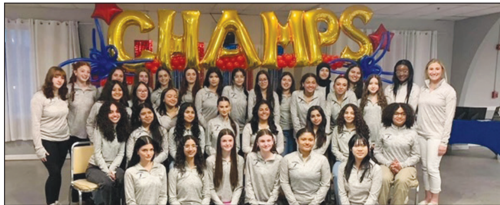
The 2024 Undefeated and GBL Champion RHS Indoor Track Team.