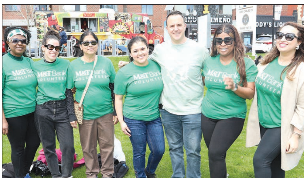
M&T Bank sent over a crew of volunteers to help with the day's task, they are shown with a thankful Mayor Patrick Keefe.