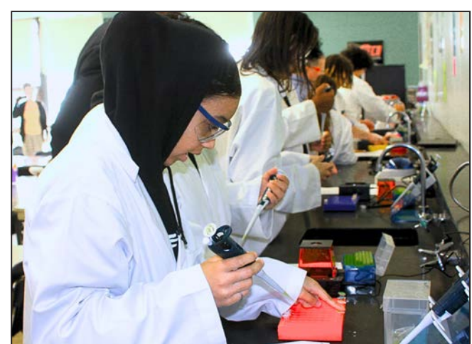
CityLab High School was one of six schools chosen as a new Clean Energy Innovation Pathway school. This designation will enable CityLab students to explore careers in high-demand industries they may want to pursue while also bolstering workforce pipelines to meet the needs of employers at no cost.

According to the Governor's Office, a key component of Innovation Career Pathways is developing partnerships with local employers and MassHire Career Boards to foster work-based learning experiences for CityLab students. The partnerships enable CityLab students to gain work experience and insight about whether the field is something they would like to pursue in college or a career after high school.