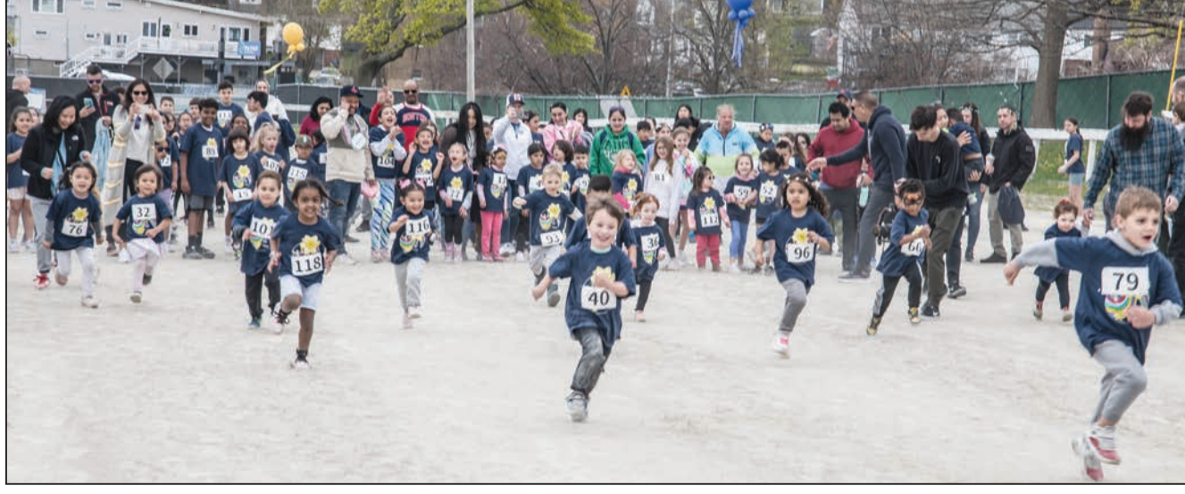
The 3 and 4 year olds take off on their run.