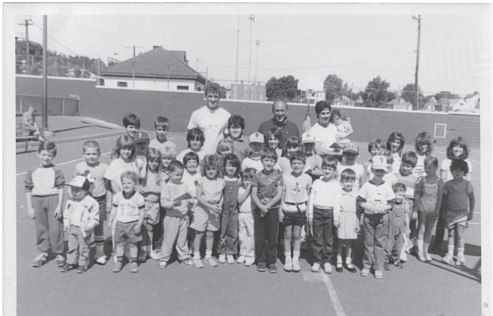
The 1986 Summer Youth Program shown with program directors and Mayor George Collela, waiting for their treats between summer activities.