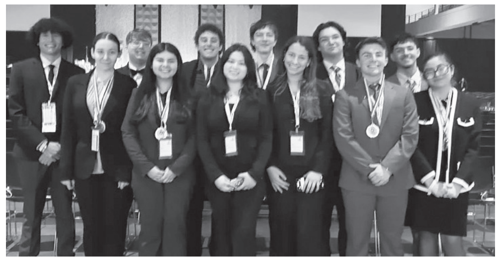
Twelve members of the Northeast Metro Tech DECA Chapter who will attend the International Career Development Conference (ICDC) in Anaheim, California in April.

Northeast earned six seats in Anaheim by competing in School-Based Enterprises (SBEs) at the gold level. Northeast was among 728 school-based enterprises that achieved gold-level certification for the 2023-2024 school year, and each SBE is represented by two students. A school-based enterprise (SBE) is an entrepreneur-