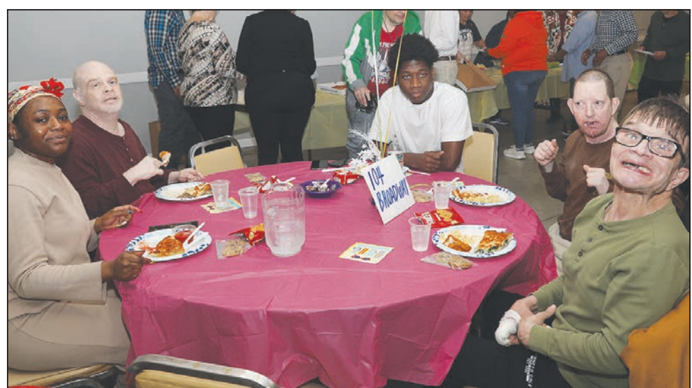
Clients from the 104 Broadway home in attendance of the Spring Fling.