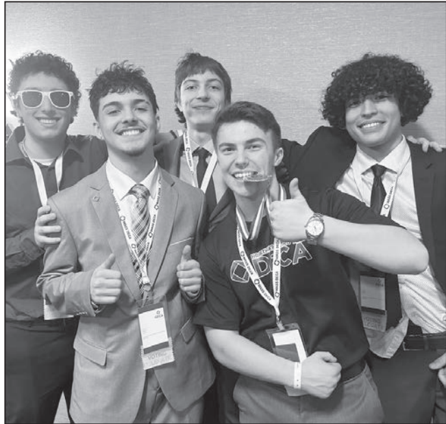
Members of the Northeast Metro Tech DECA Chapter celebrate their success.