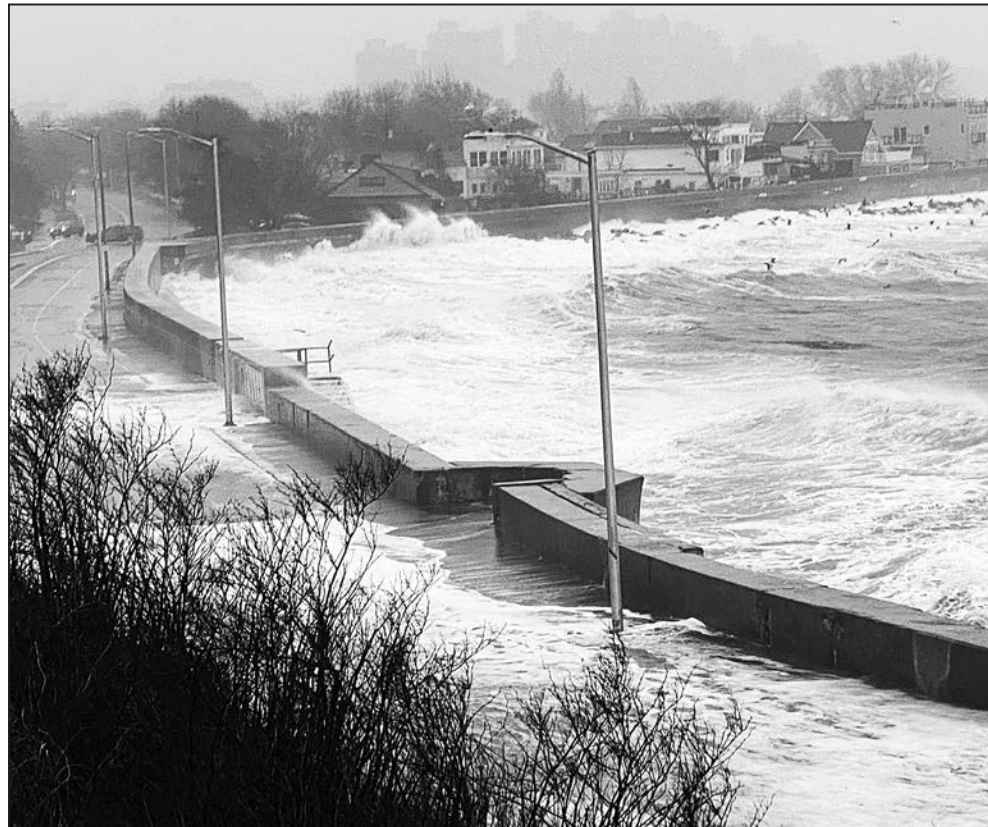
The open tide gates on Winthrop Parkway provided no defense to the recent flooding that occurs in the neighborhood.