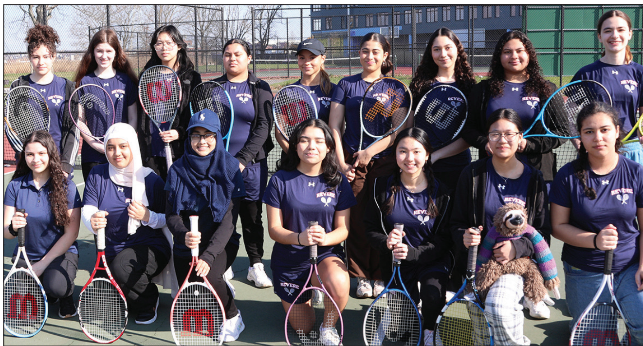
The members of the RHS varsity Girl's Tennis Team at Gibson Park Courts.