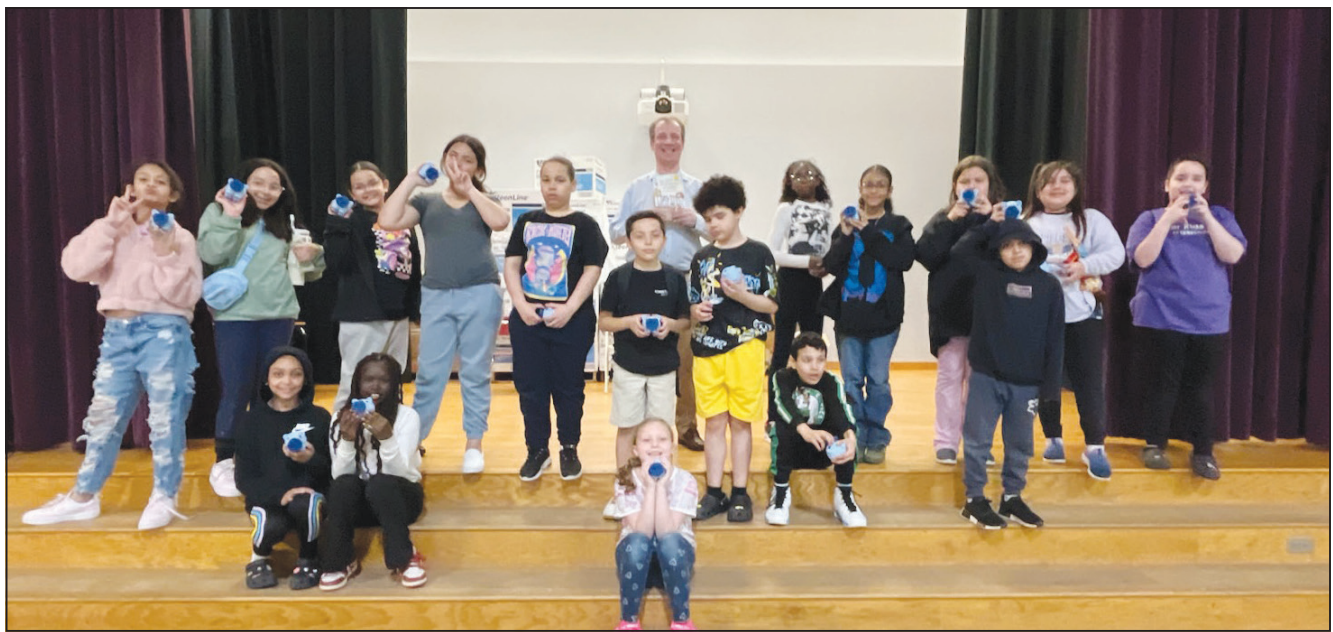
Cambridge Savings Bank recently visited For Kids Only Afterschool programs in Chelsea, Revere and Winthrop. Their interactive sessions were both educational and inspiring. Every child received their very own piggy bank, courtesy of Cambridge Savings Bank. It's never too early to start building good financial habits, and thanks to their generosity, FKO children are off to a great start.