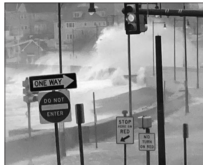
Waves crash over the seawall at Short Beach on Winthrop Parkway.