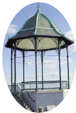
First Public Beach