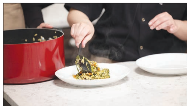
A student scoops up some of the creamy chicken pesto orzo dish that Culinary Arts students made during a filming of Northeast Cooks, the students’ new cooking show on RevereTV.