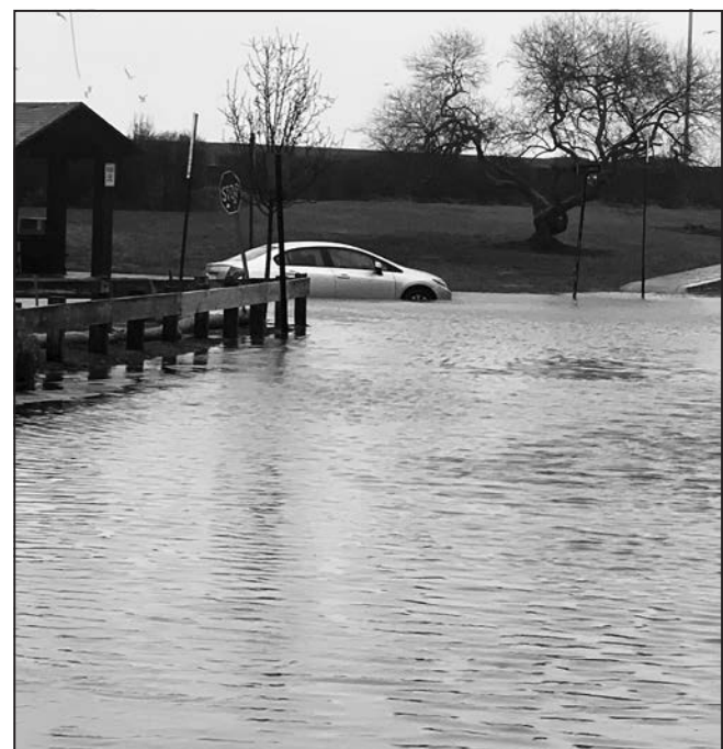
Flooding as seen on Leverett and Broadsound Ave.